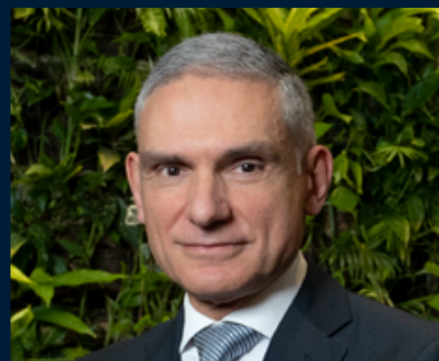
Δρ. Κυριάκος Σαμπατακάκης

Πρόεδρος Εκτελεστικής Επιτροπής, TITAN & Πρόεδρος ΣΕΒ